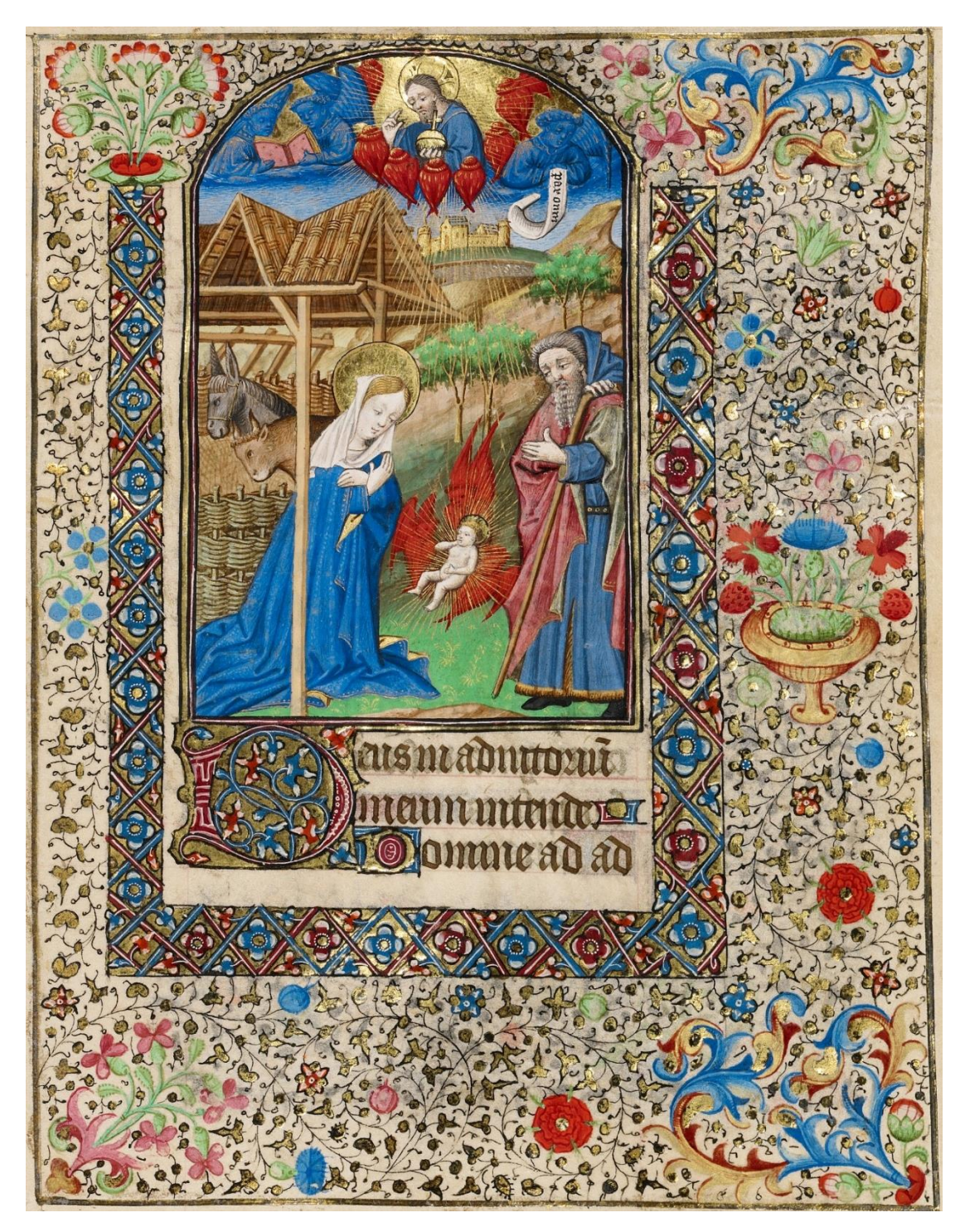
FEAST of the NATIVITY

PROCESSION & SOLEMN HIGH MASS 24 DECEMBER 2023