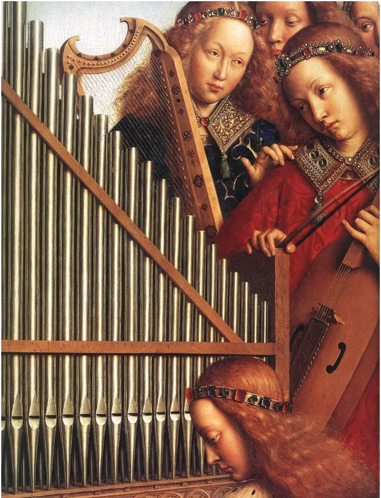
Liturgical Choral Music Spring 2023 S. STEPHEN'S CHURCH, PROVIDENCE